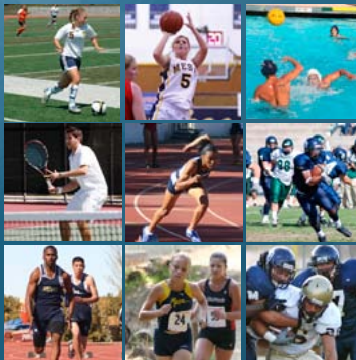
Athletic department photos courtesy of Todd Curran.

Search for "Mesa College dance" on YouTube.com for performance clips, and even mid-terms and finals!