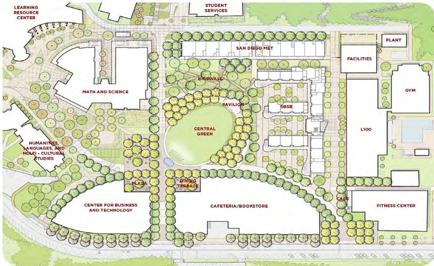
SAN DIEGO | MESA COLLEGE QUADRANGLE MASTER PLAN THE OFFICE OF JAMES BURNETT