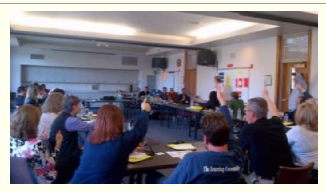
Spring President's Cabinet Retreat

April 29th, 9 am -3:30 PM Marina Village Conference Center