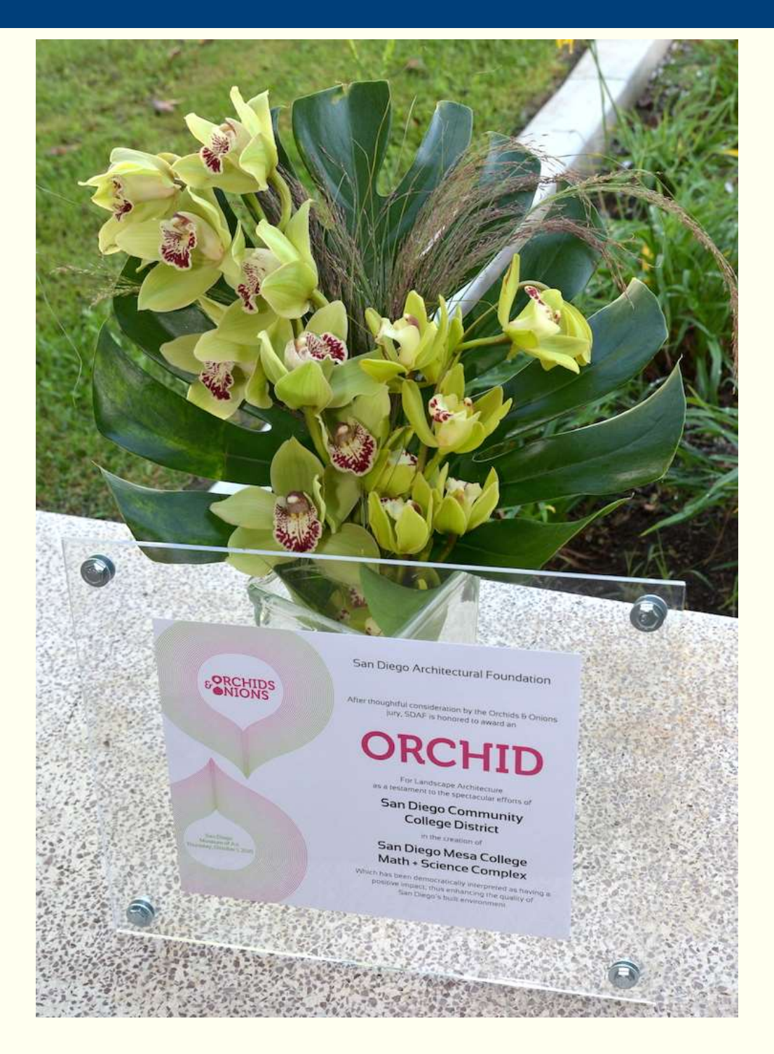
Board of Trustees Mesa College Meeting - Thursday, October 8th