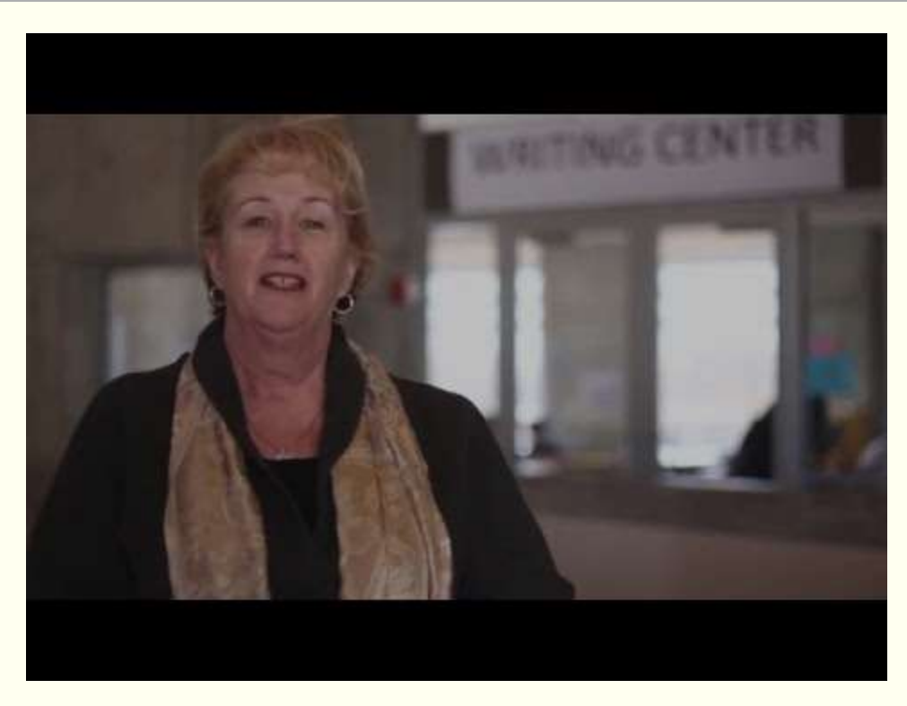
Click to watch the video