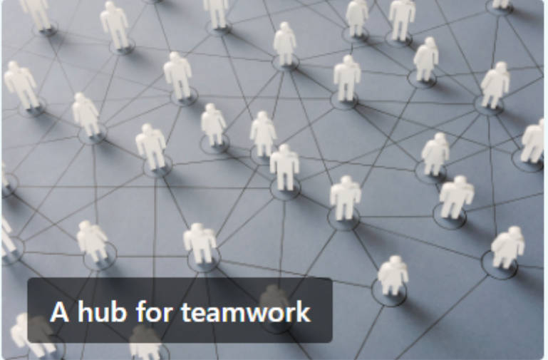
One central hub to meet, work, call, and chat.