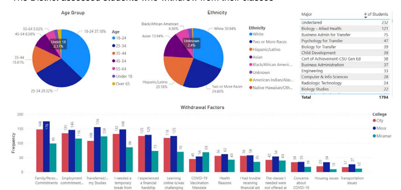
Why did you stop attending classes? (Check all that apply)