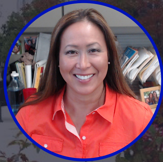
Ailene Crakes Student Success & Support Program