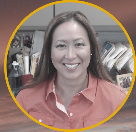
Ailene Crakes Student Success & Support Program