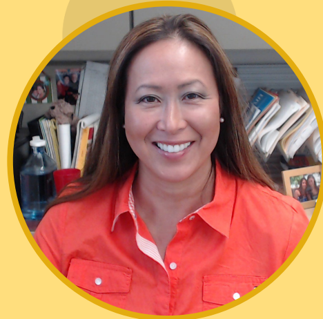
Ailene Crakes Student Success & Support Program

Student Success, Equity & Transformation